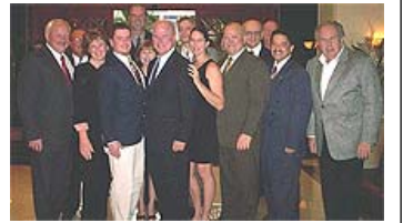
Ambassador's Reception – Panama Trade Mission 2005