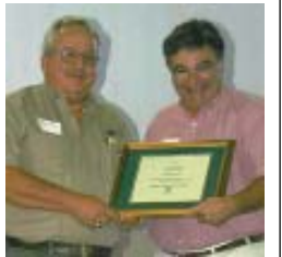
Industry Appreciation Day 2005