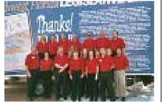
County leaders in Tallahassee for NW Florida Legislative Day